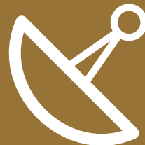
SATELLITE MEDIA EVENTS

Get national news coverage for your brand, and convert viewers into customers with our influence and Satellite Media Events.