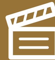
3 ECHOES PRODUCTIONS