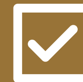
CHECKING IN WITH CHELSEA

Checking In With Chelsea can feature your brand and product with web show sponsorships, blog and social posts, custom videos, contests and more to reach the coveted young American demographic.